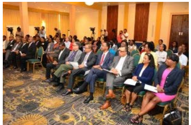
A section of the attendees at the opening ceremony of the workshop, held at the Pegasus Hotel earlier Monday, May 22, 2017.